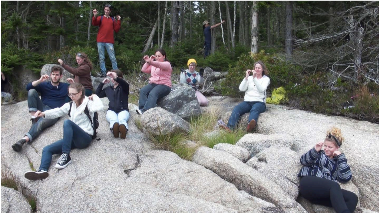
Still from The Birds . 2014. Two-channel video installation (color, sound). Five-minute loop.