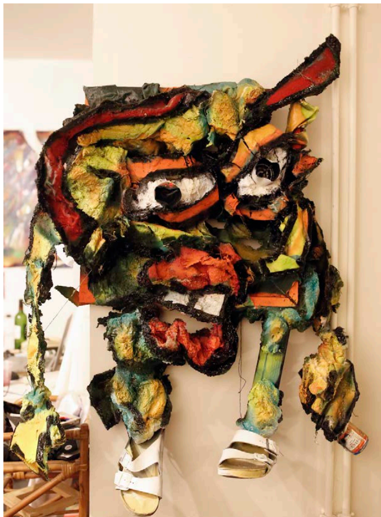
Untitled . 2013. Mixed media and found objects. 35 x 35 x 12 inches.