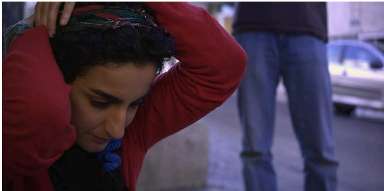
Still from The Wind is Blowing on My Street . 2010. Live action short film (16:9). 15' 37"