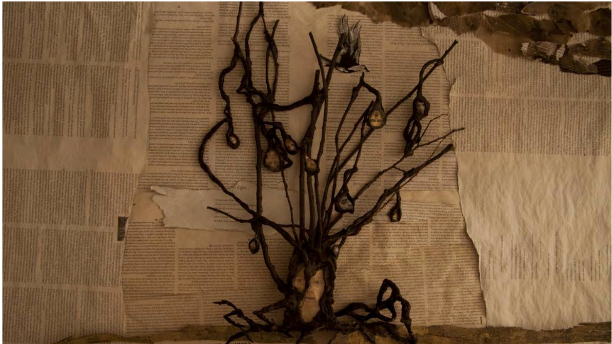
Still from Even Gray Feels Blue . 2012. Stop-motion short animated film (16:9). 8' 18"