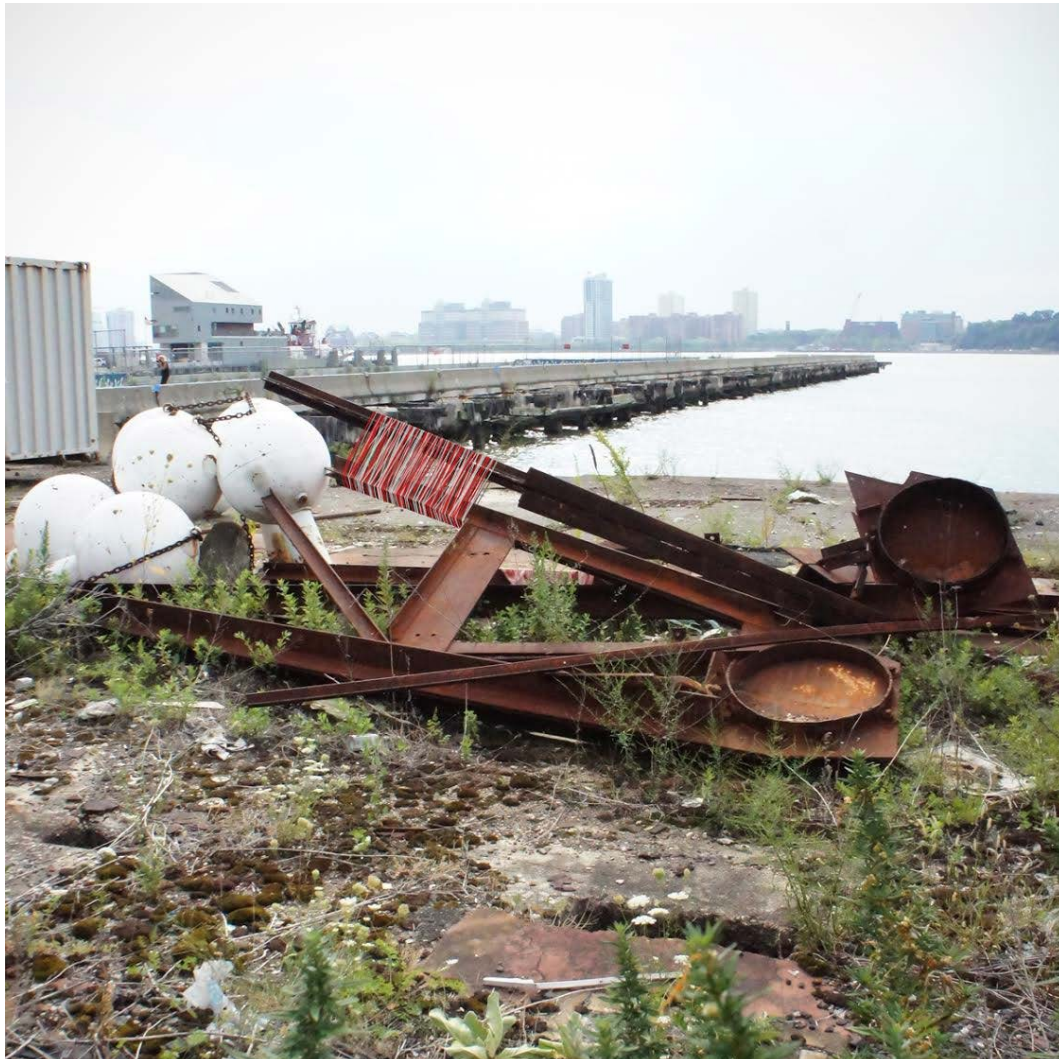
Holding On. 2014. Interactive installation. Mixed media (yarn, furniture, soil). 4 x 4 x 8 feet.